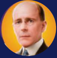
Rtn. Paul Harris FOUNDER OF ROTARY